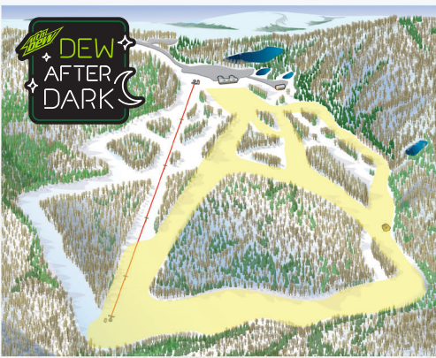
LAUREL MOUNTAIN NIGHT SKIING TRAILS